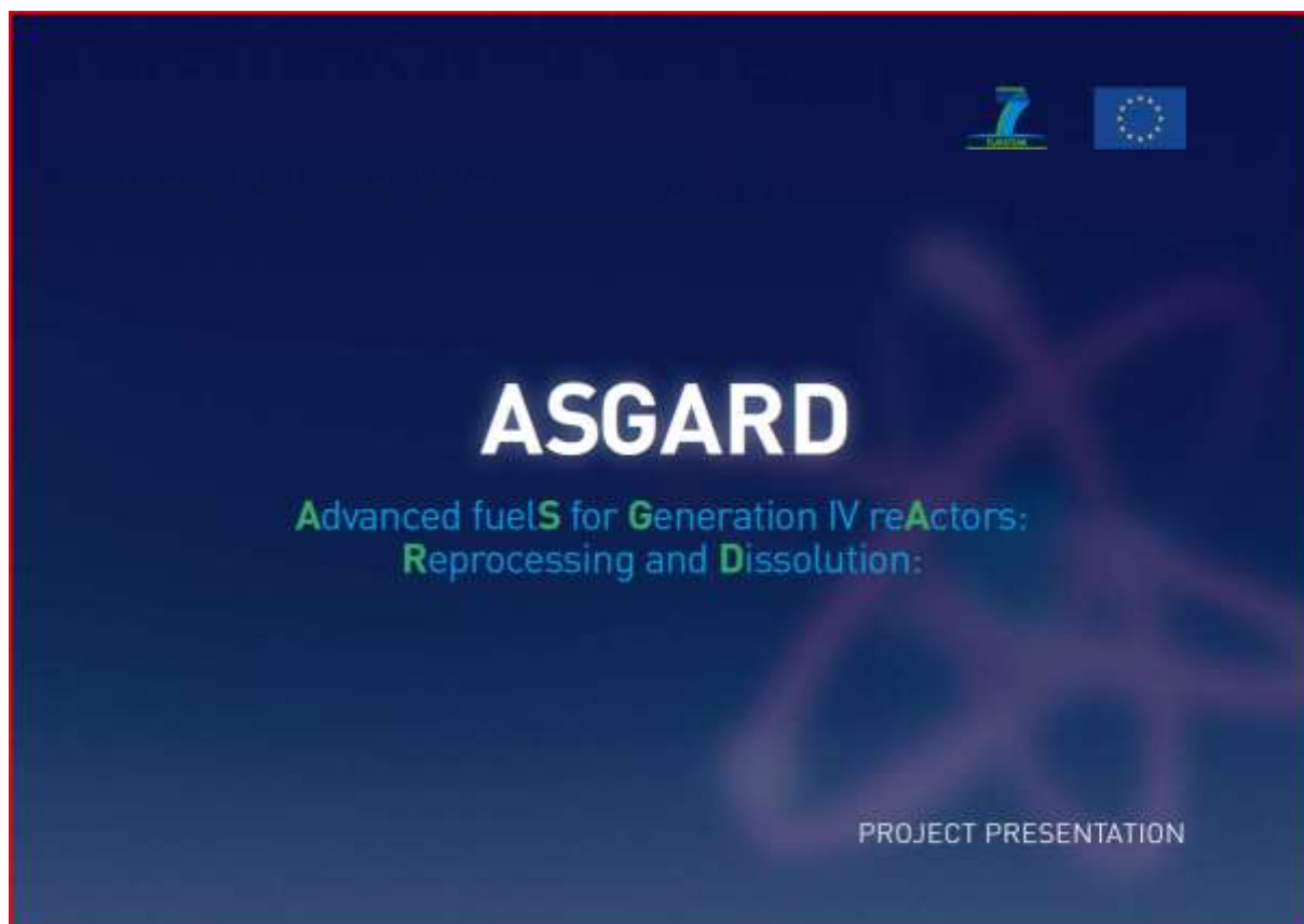
Figure 5 Frontpage of official ASGARD presentation