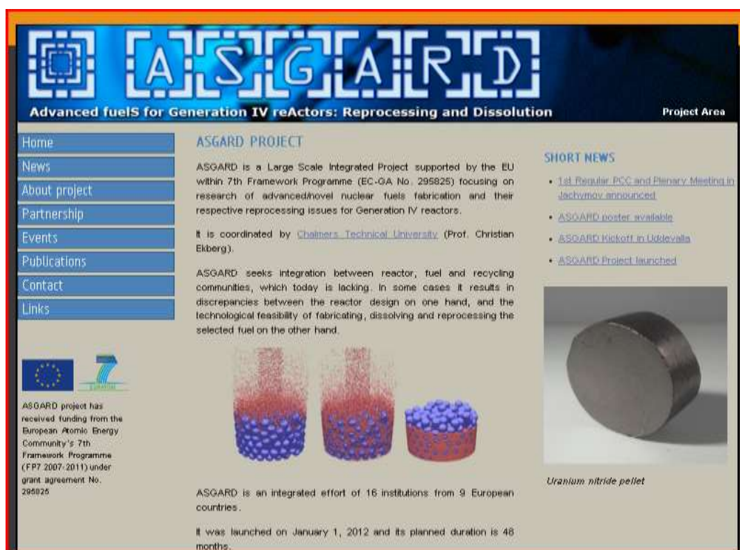
Figure 1 ASGARD website

The project website is available at http://www.asgardproject.eu