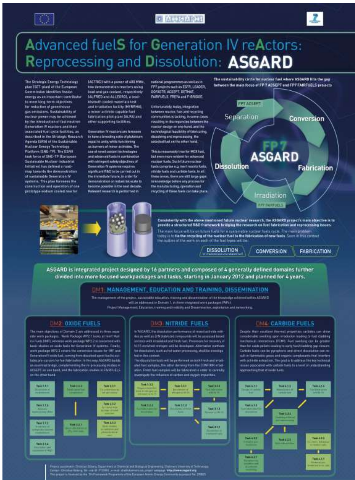
Figure 3 ASGARD poster no. 1