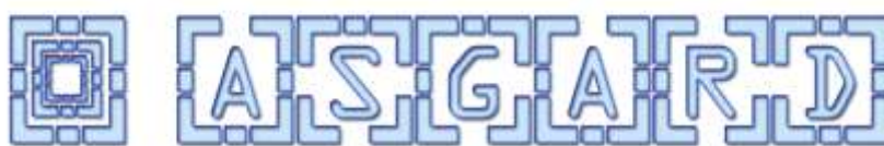
Figure 2 ASGARD logo